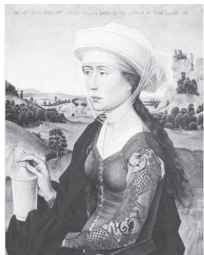
Fig.4 Rogier van de Weyden, Portrait of Maria Magdalena, 1450